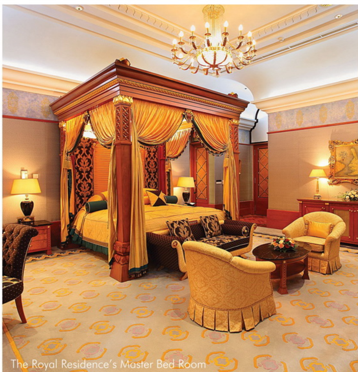
The Royal Residence's Master Bed Room